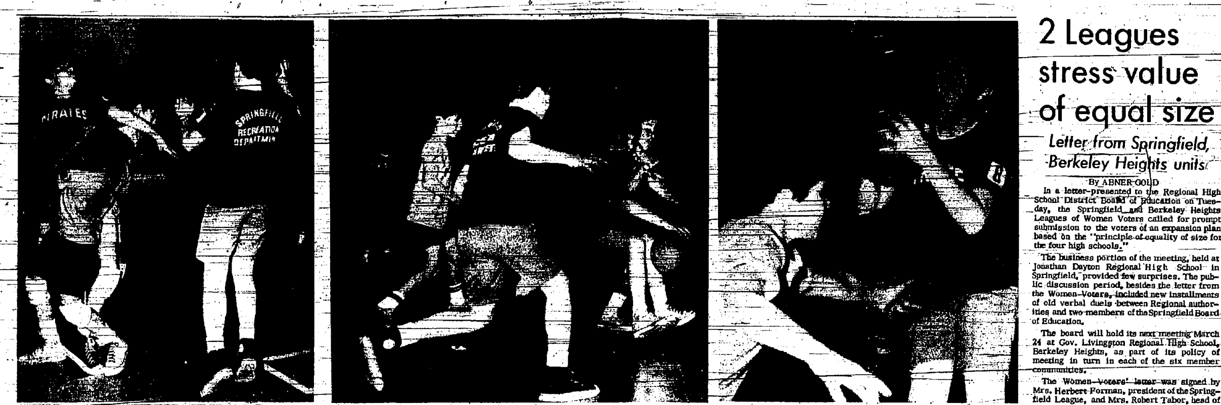
Top speed is the way basketball is played in the Small Fry League at the Thelma Sandmeier School.