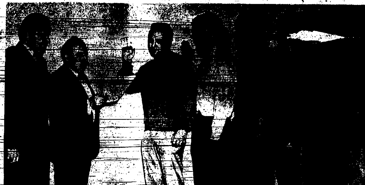
JOHN POLICE RESERVES... (Caption text is partially obscured and difficult to read)

The U.S. League of Women Voters will sponsor a national campaign during 1970 designed to celebrate the 50th anniversary of the League's founding and to improve the existing system of the national electoral process.