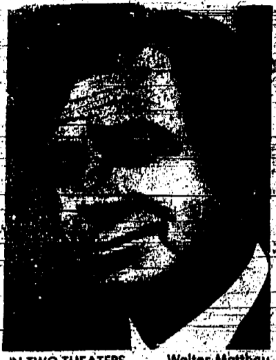
IN TWO THEATERS—Walter Matthau stars opposite Elaine May in 'A New Leaf' film comedy in color, which came to the Elinors, Theater in Ellerslie and the Mayfield Theater in Hillside, yesterday.

Being 15 years old is difficult. It's an age when changes occur, when a boy starts to become a man. 'Summer of 42', now playing at the Ormont Theater in East Orange, describes these changes in an unexpurgated but beautiful fashion.