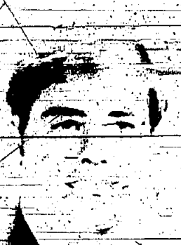
Exec named at McFarlan