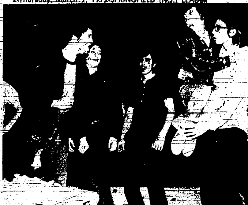
NOTHING LIKE A DAME—Summing up the universal plight of servicemen overseas are those cast members of 'South Pacific' to be staged March 23, 24 and 25 at Jonathan Dayton Regional High School, Mountain Avenue, Springfield, at 8:15 p.m. Thursday, Friday and Saturday, March 23, 24 and 25.