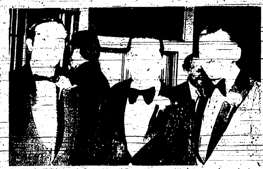
GRAND OPENING - Executives of Town & Campus West Orange, formerly the Goldman All Seasons Hotel, greeted more than 2,000 guests...