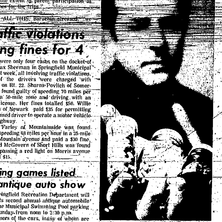
KILLERS - A flail of potential child killers helps draw attention to National Poison Prevention Week, March 19-25. See story and photo on Page 13.

The Springfield Recreation Department will sponsor its second annual antique automobile show at the Municipal Swimming Pool parking lot, Sunday from noon to 2:30 p.m.