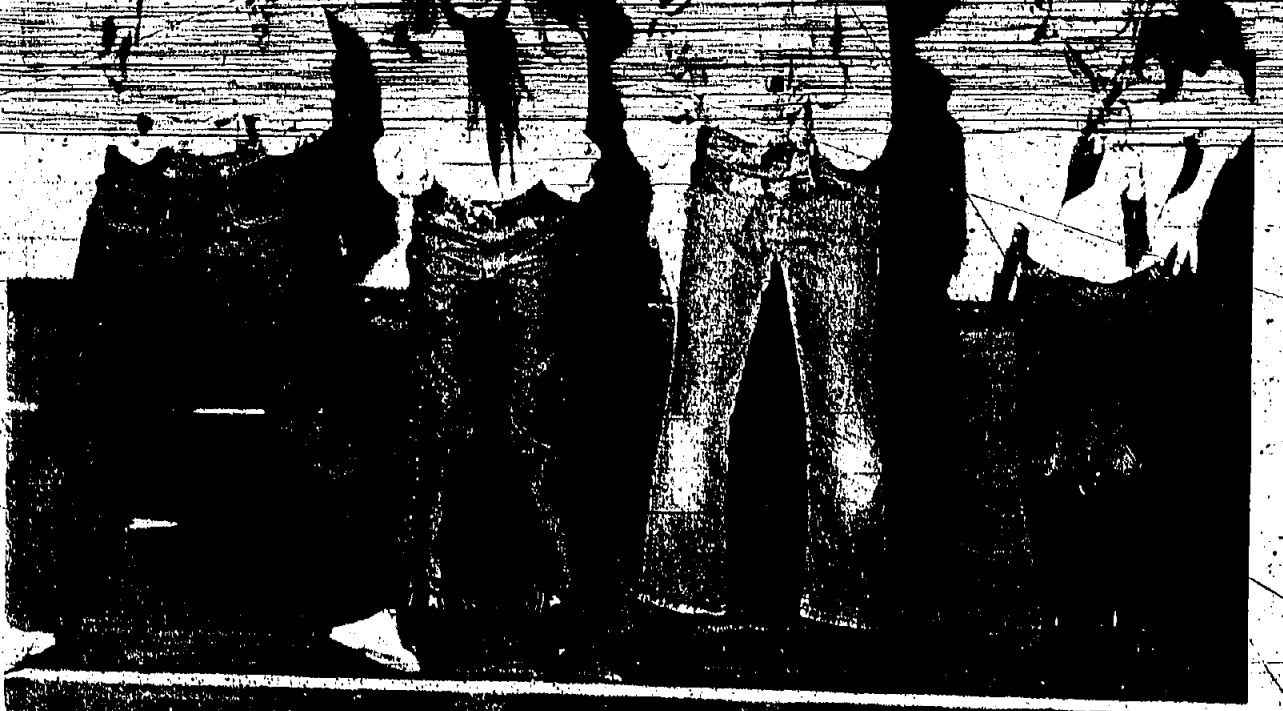
QUICK ON THE DRAW—Springfield girl Scouts brush on their Western dance skills in preparation for their annual fair...