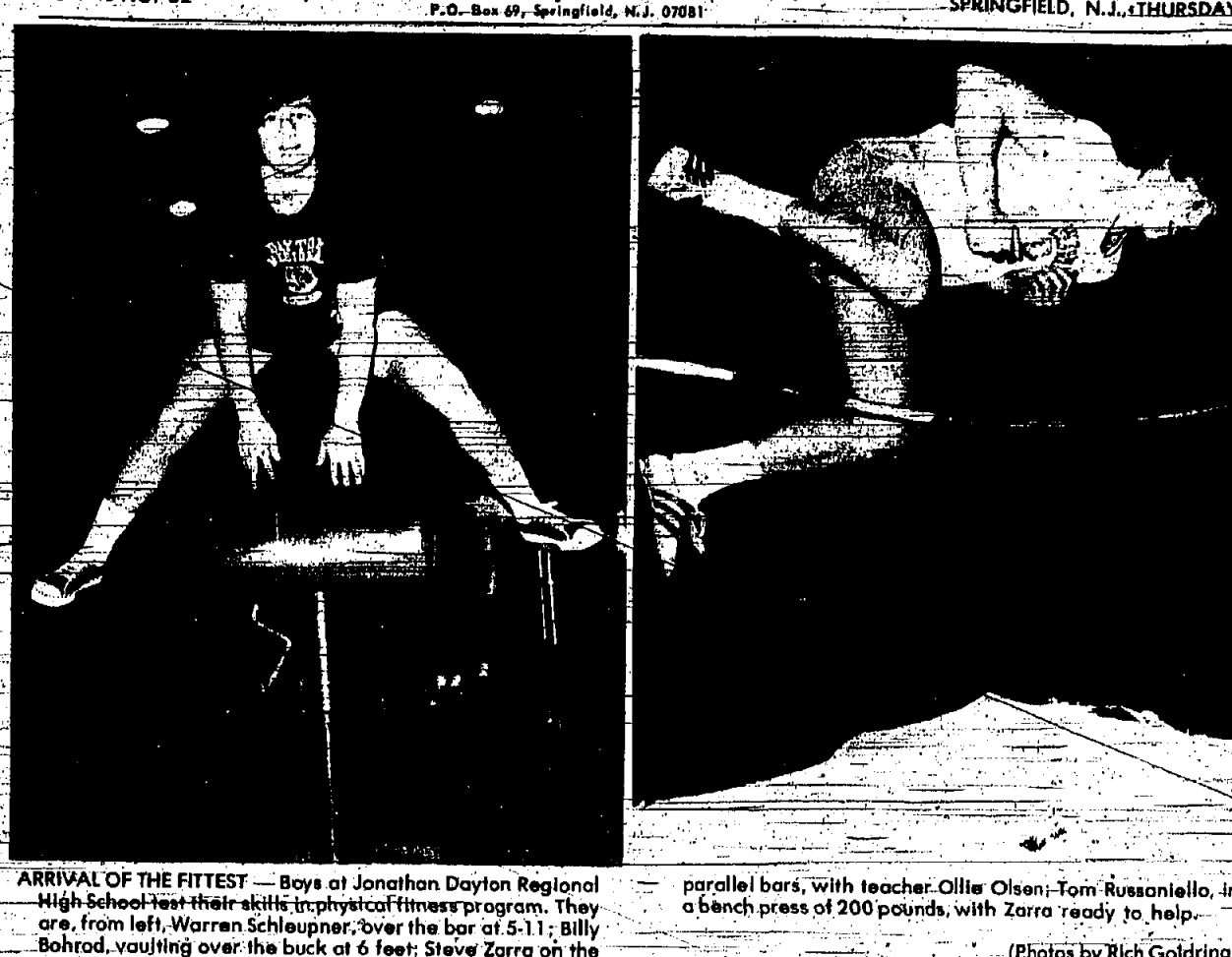
ARRIVAL OF THE FITTEST—Boys of Jonathan Dayton Regional High School test their skills...