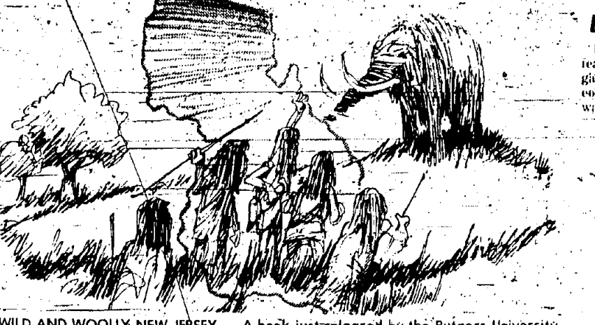
WILD AND WOOLLY NEW JERSEY - A book just published by the Rutgers University Press, "The Delaware Indians: A History," reveals that prehistoric hunters pursued mammoth and mastodon across New Jersey more than 10,000 years ago.