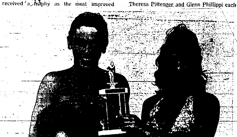
Swimmers and coaches at the award ceremony.

The Springfield swim team closed its season with a party and awards ceremony at the community pool. Six swimmers received trophies for their achievements during the season.