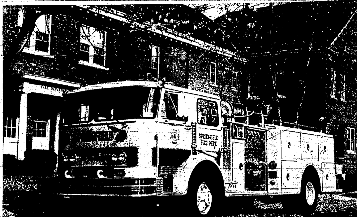
NEW ENGINE, NEW COLOR — If you hear a fire engine siren and a flash of green passes, it's the Springfield Fire Department's latest acquisition...