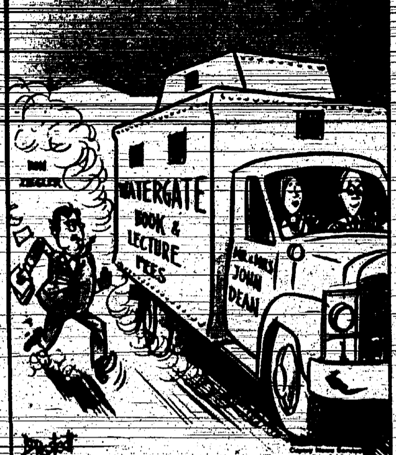
"Hay" worth for me!