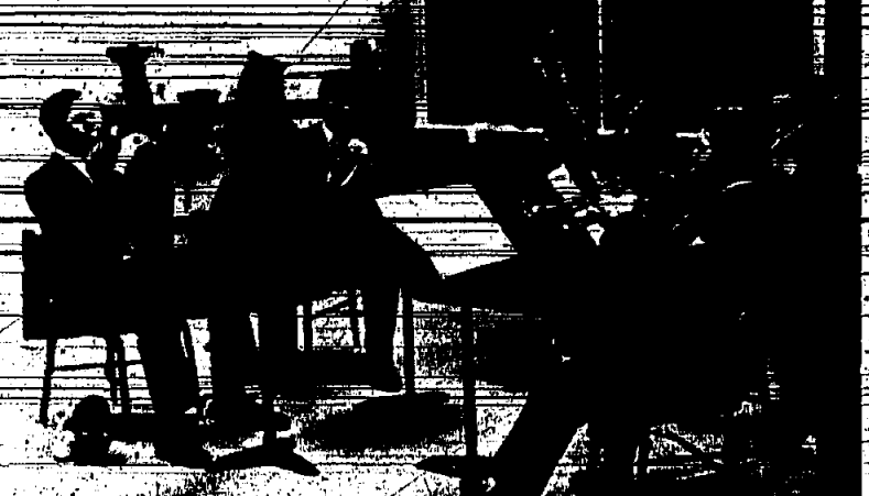
Prayer group members gathered for a meeting at the home of...