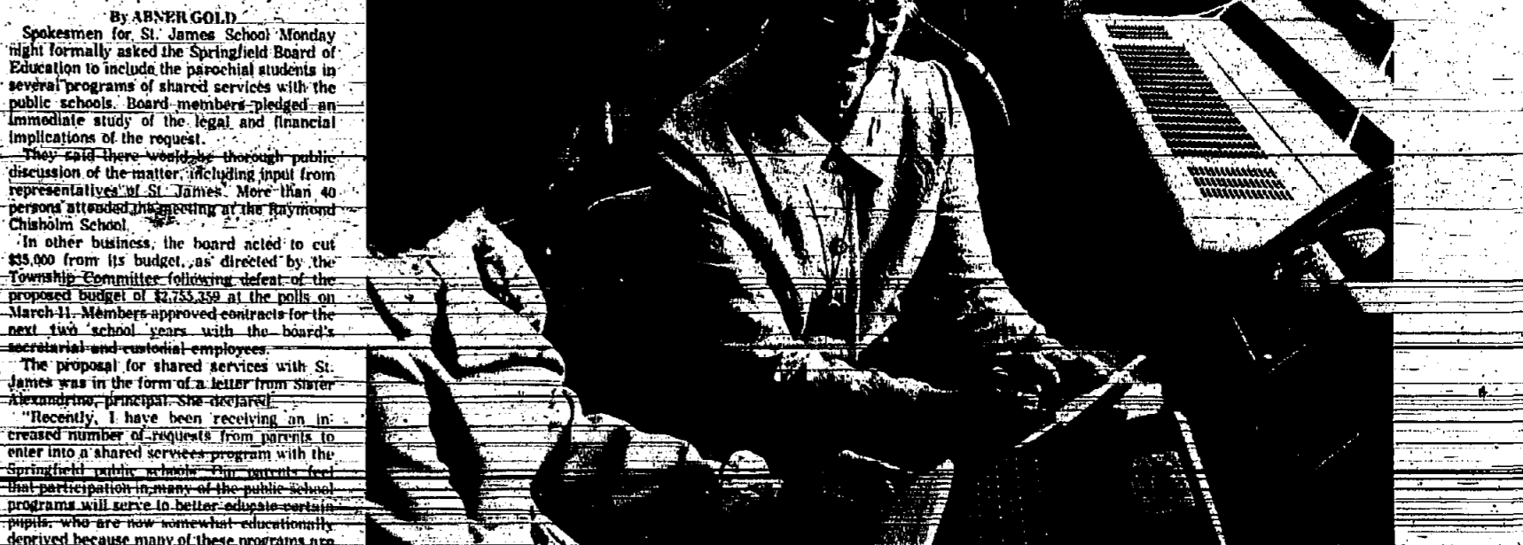
Description of the group in the photograph.