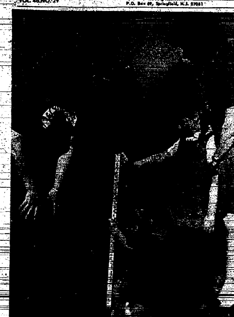
Description of the person in the photograph.