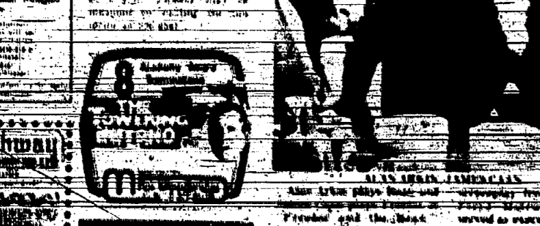
Freebie and Bean film comes to screen at Park...