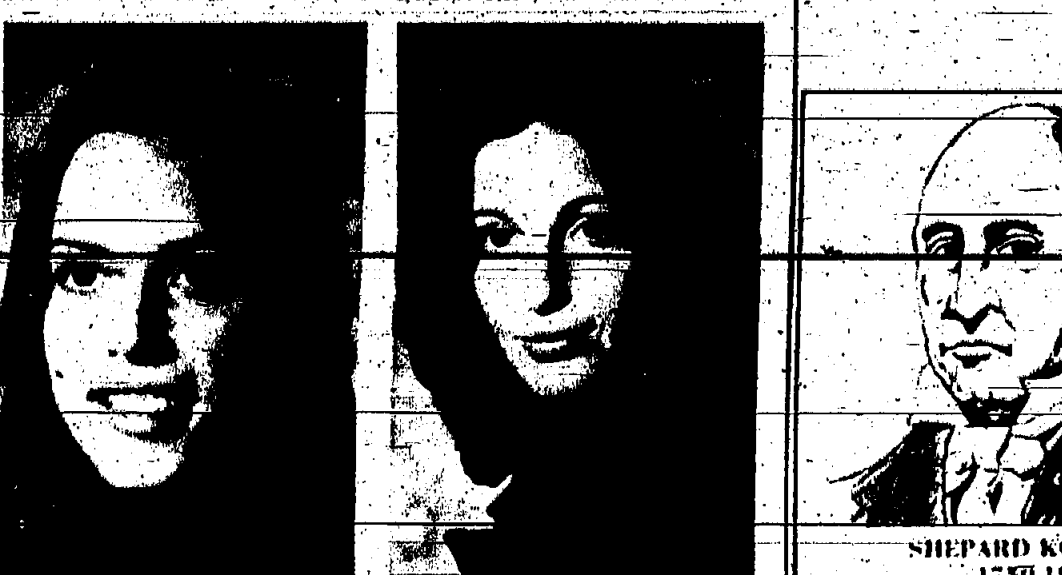
2 Springfield students cited

BY THE 'N' MEMBERS of human generally affected, it would appear that psittacosis is a disease of New Jersey, or at least not a fashionable one in our climate. Psittacosis does not seem to be found as a disease of the birds in New Jersey. The disease is a disease of the birds in New Jersey. The disease is a disease of the birds in New Jersey.