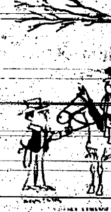
Illustration of a person riding a horse.