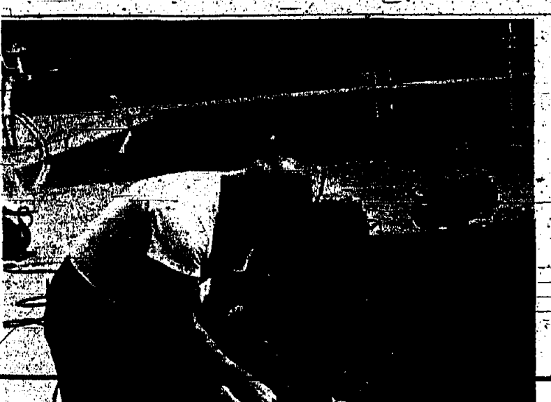
DIVING IN - Fiddlerball player, right, get a head start on the Springfield Municipal Pool...