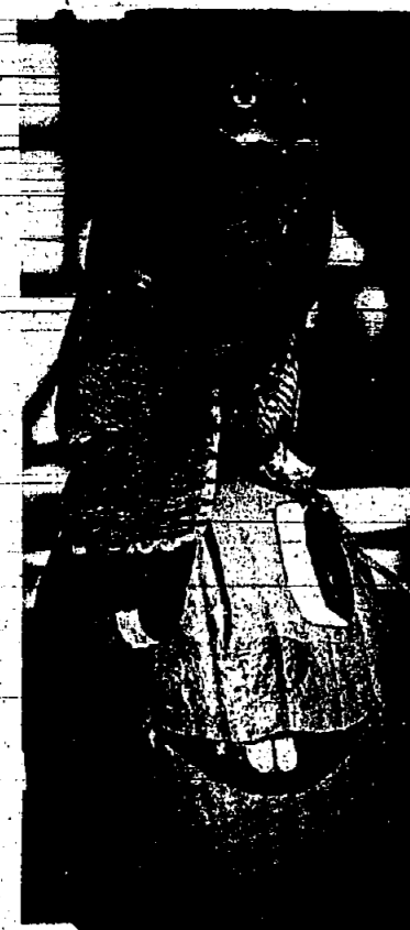
WONT GIVE HOOT — Bubba, Turtle Bock Zog's great horned owl, is stirring plenty of jack-o'-lanterns while waiting for Halloween tomorrow. Bubba usually is found at the zoo's educational building, 560 Northfield ave., West Orange, every day from 10 a.m. to 4:30 p.m.