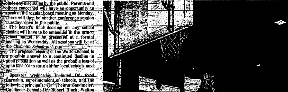
St. James gym presentation March 23; pupils offer play