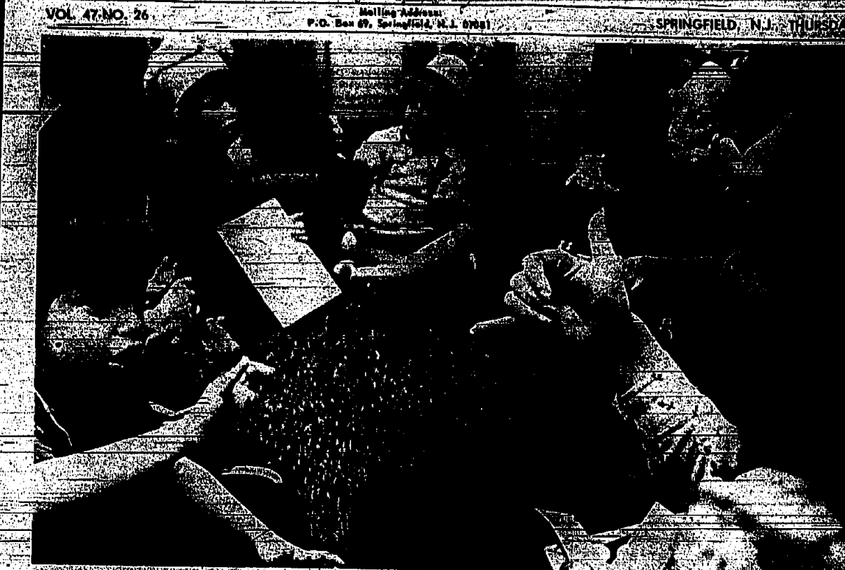
SIGNS OF LEARNING: Hearing-impaired youngsters from six counties are learning to communicate verbally.