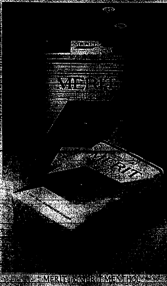
MERIT. ENRICHED FLAVOR.

In case of emergency call 374-0400 for Police Department or First Aid Squad 374-7670 for Fire Department