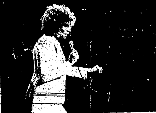
BARRA STREISAND entertains throng of fans in 'A Sign Is Born'...