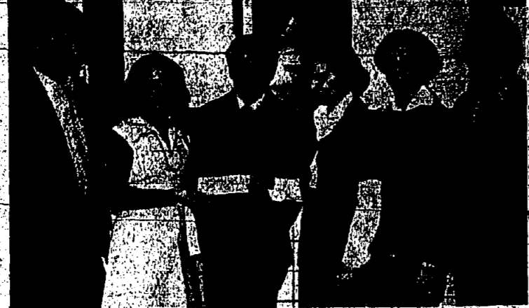
PROCEEDS OF PAPER DRIVE DONATED—The Juniors' Women's Club of Connecticut Farms, Union, and the Union High School Ecology Club presented funds raised through paper and aluminum collection to Union County Unit, New Jersey Association for Retarded Citizens.