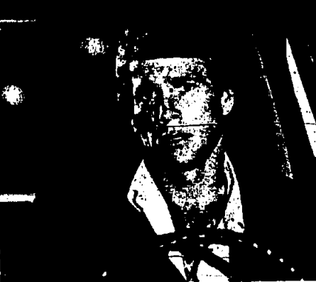
RYAN O'NEAL—Actor plays title role in 'The Driver'...