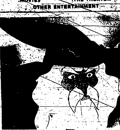
WIZARD GANDALF—One of Nine Companions is seen in scene from J.R.R. Tolkien's 'The Rings' which continues its run at the Bellevue Theater, Upper Montclair.