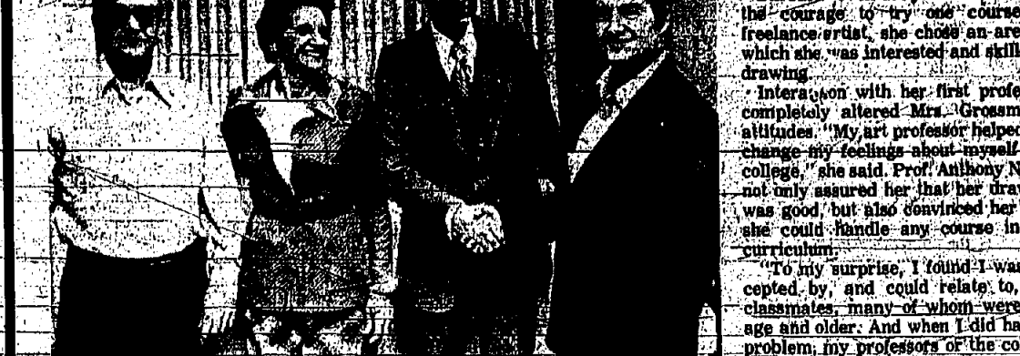
NEW OFFICERS OF STROKE CLUB sponsored by the Union County Chapter of the American Heart Association.