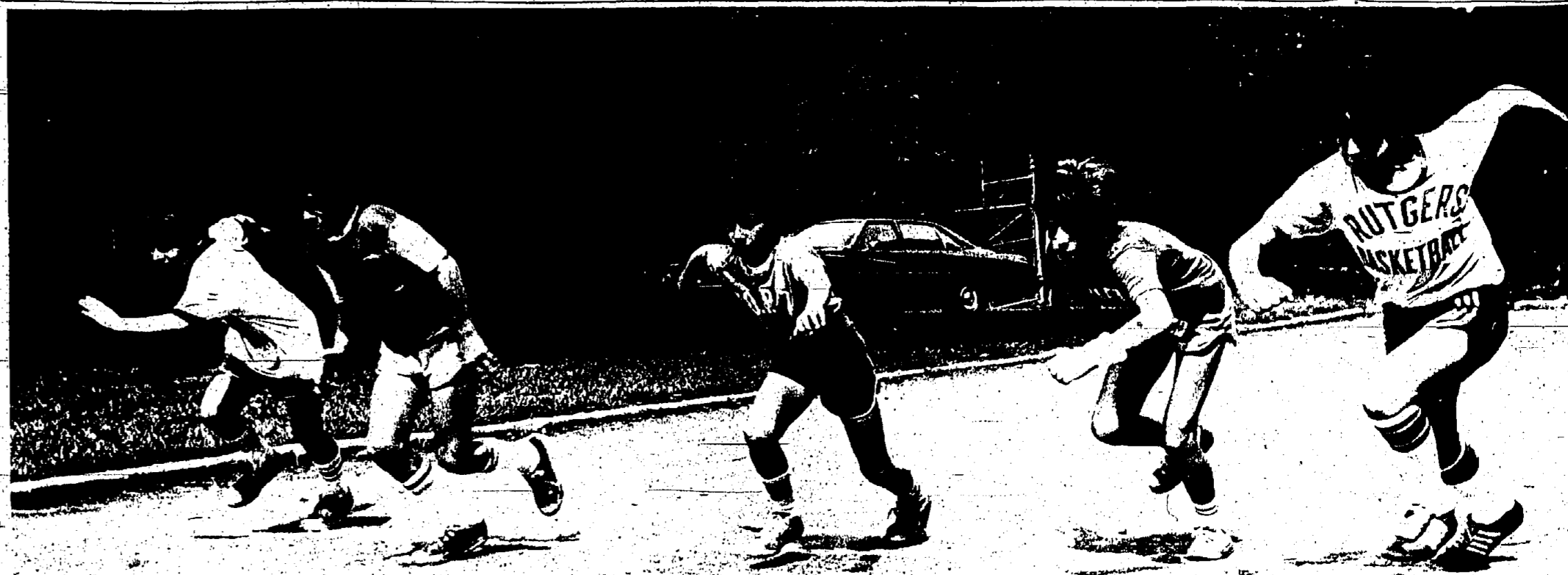
Youngsters leave the starting line in Springfield playground Olympics. See details on sports page.