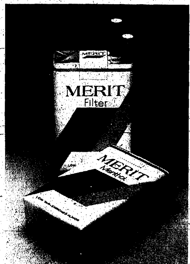
REGULAR and MENTHOL

Warning: The Surgeon General Has Determined That Cigarette Smoking Is Dangerous to Your Health.