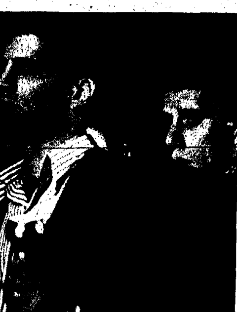
Yanks to open A nostalgic film about the American Expeditionary Force in World War I...

Cedric's Fish 'n Chips is Back! FISH 'N CHIPS LOVERS! HOT DOG LOVERS! CHICKEN LOVERS! SEAFOOD LOVERS!