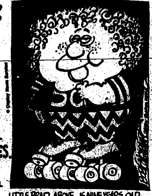
LITTLE BOY ABOVE, 6 IN YEARS OLD, HE HAS A CHIEF SEED AND ONLY ONE GOOD LEGSURE SUIT AND IS POKED TO LIVE IN A TRI-LEVEL. THERE ARE MANY OTHERS LIKE HIM. PLEASE WRITE TODAY.

WRITE TO: APPPI AMERICAN FOSTER PARENT PLAN P.O. BOX 170 LOS ANGELES, CA.