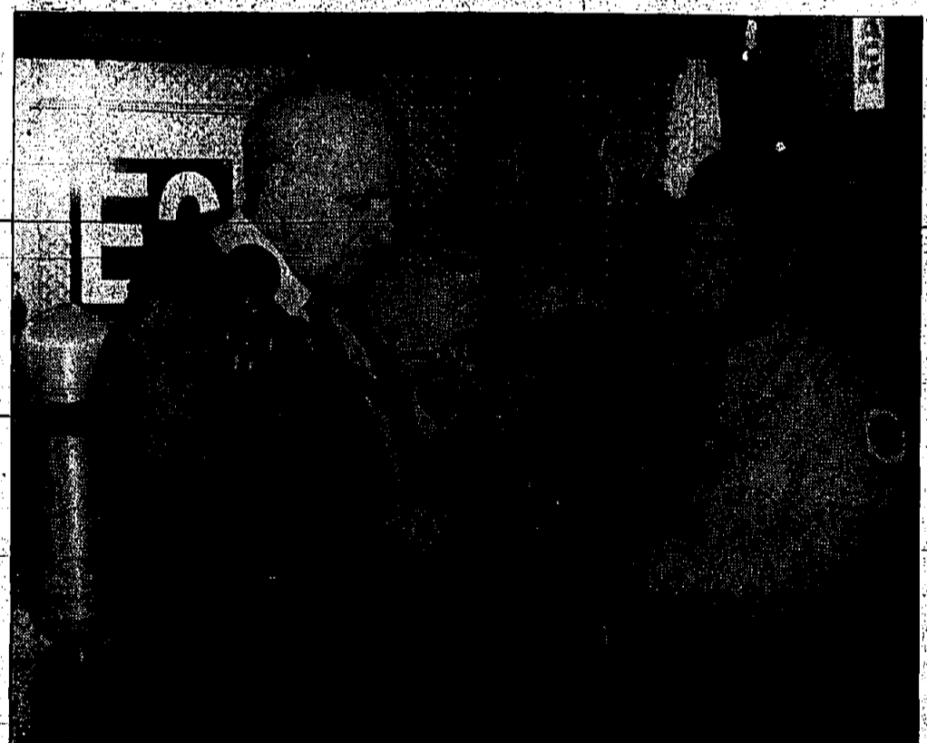
LIFE SAVING TOOLS — Springfield Mayor Philip Kurmos, left, tries on the Interspiro self-contained breathing apparatus during a demonstration at the Springfield Fire House last week.