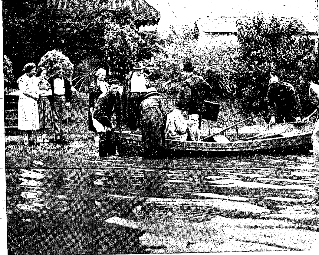
Four years ago Springfield faced flood damage considerably more than Sunday's severe storm. Marlon families being rescued by police in Marlon avenue after the rainfall halted.