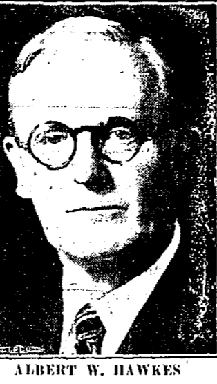
ALBERT W. HAWKES