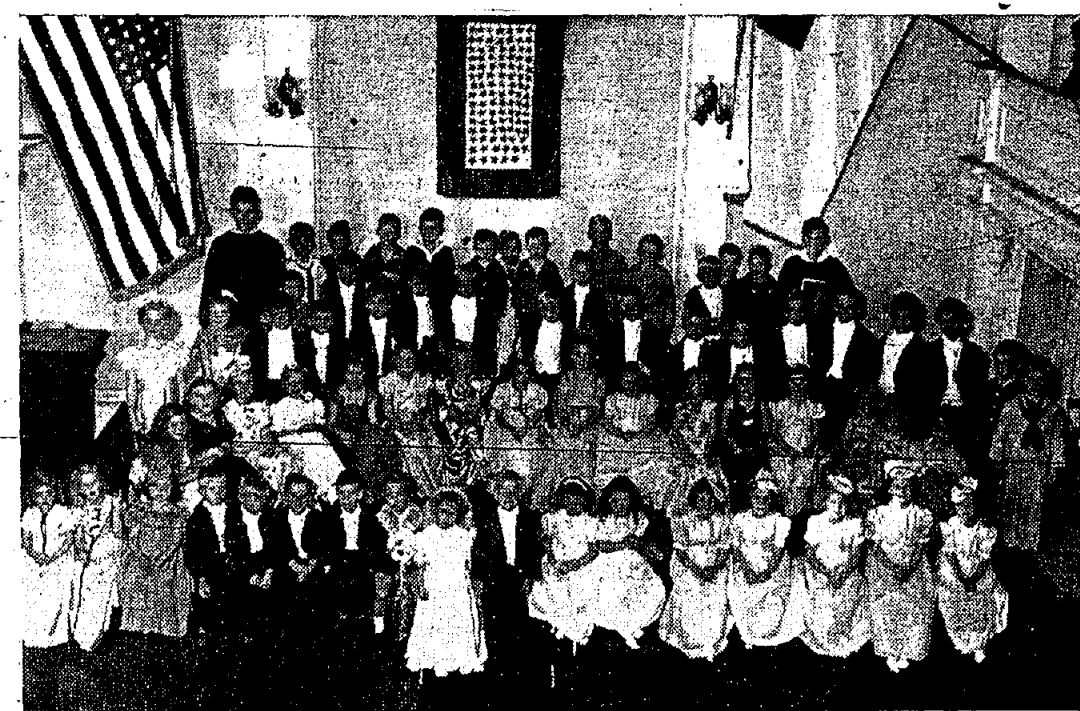
The cast of 'The Tom Thumb Wedding' which was performed to a capacity audience Friday night in the Presbyterian Church, under the auspices of the Ty-An Club.