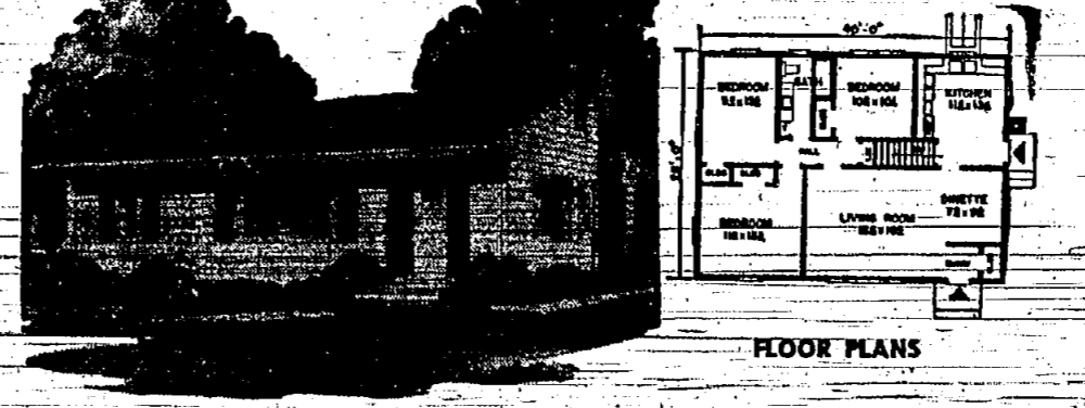
Architect: A. L. Oppel - 40 Feet Long, 28 Feet Wide 3 1/2 Full Size Rooms

We will have on Exhibit a full size Weyerhaeuser Modular Home, which will be open for inspection, as illustrated below: