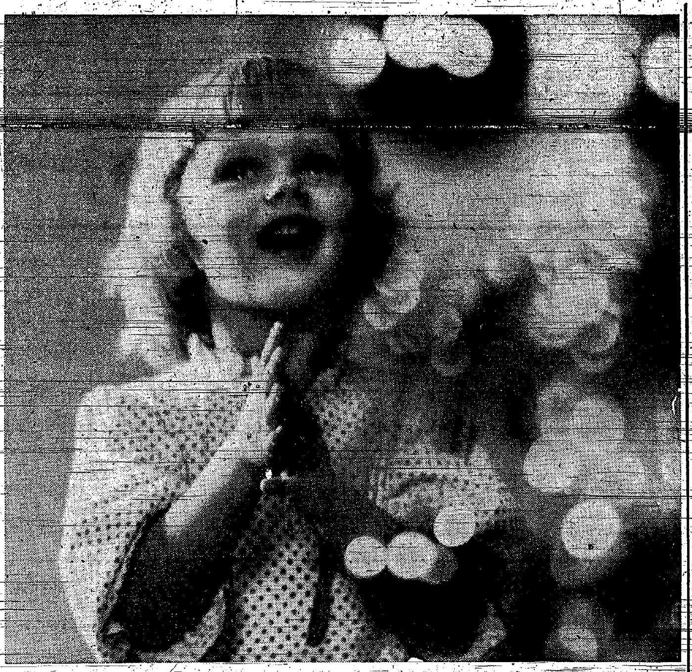
The shining light of faith

Now you see it, shining more brightly than at any other time of year. Faith. The Faith of the little ones, so sure their wishes will come true. The Faith of parents, equally confident that somehow they will make this the most wonderful holiday the children have ever known.